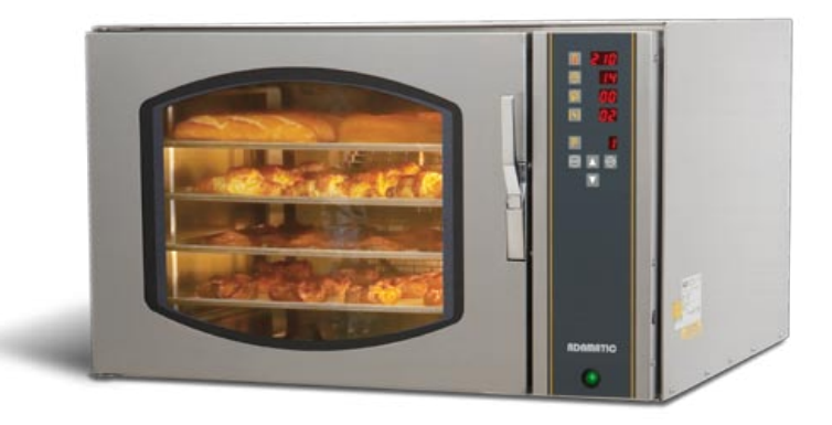
Model: BX4-C (with Classic controller)